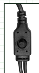
In-Line Cable Mounted OSD Control