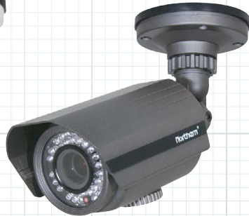
CB700VFIR960 / CB700VFIR5960