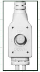
In-Line Cable Mounted OSD Control