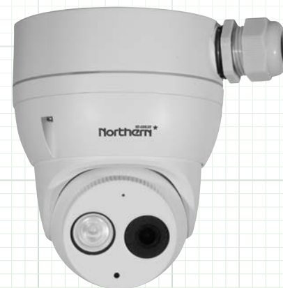
Shown with HDTIR90WD (Camera not included)